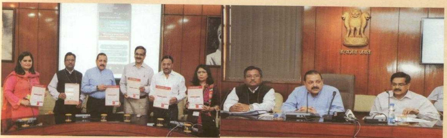
Hon'ble MoS(PP), Dr Jitendra Singh with the senior officers of DARPG and DoPT

The citizen can view the status any time - anywhere using the mobile App